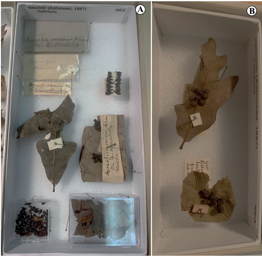
Figure 2. Galls deposited in USNM collection A on Quercus stellata (as Q. obtusiloba ) similar to Osten-Sacken galls, confusingly described by Ashmead as “The Huckleberry-like Gall”; card-mounted galls are labelled “Type 2866” but are not syntypes (explanation in text) B similar galls, erroneously labelled as cotypes of Zopheroteras vaccinii , collected by Ashmead in Florida on Q. stellata (as Q. minor ).

Beutenmüller (1913) mentioned that A. vacciniiformis galls are similar to the huckleberry fruit or to Celtis occidentalis L. fruit, but these fruits have different shapes; huckleberry fruit is truncated distally and depressed centrally and C. occidentalis has a pointed fruit.